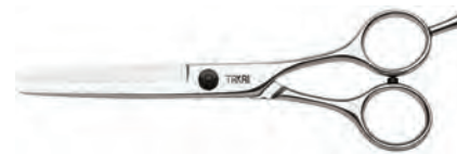
• VUH 420 (42 teeth) 360€