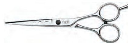
• ZOOM (5.5") 320€