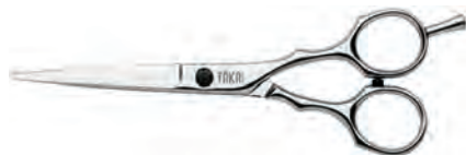
• DUAL (5"/5.5") 320€