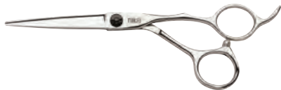
• JUNKO (5.5") 290€