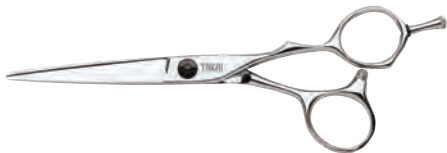
• KUMA (5.5") 290€