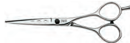
• VSP2 (4.5"/5"/5.5"/6") 360€