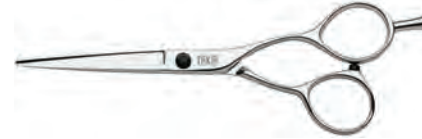
• OXALIS (5.5") 320€