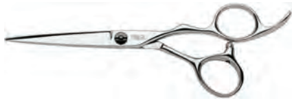
• AKIO (5"/5.5"/6.3") 290€