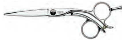
• EIKI (5.5") 290€