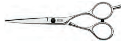
• ODYSSEE (5.5") 320€